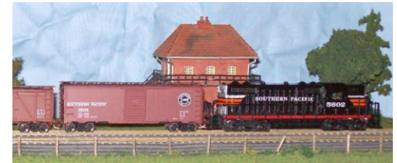
Lionel GP9 with Gold Coast Box cars.