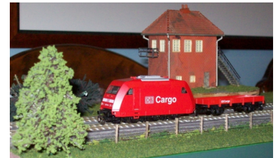
Tillig class 109 with gondola.